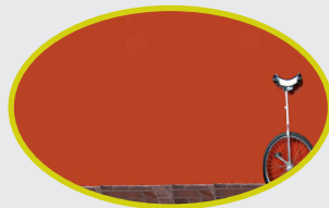
Theatre & Performance