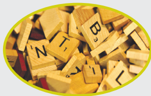
Language & Linguistics