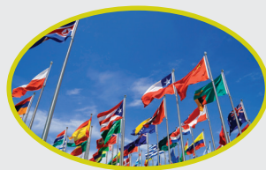
International Relations & Development