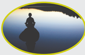
Philosophy & Religion