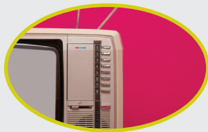
Media & Culture