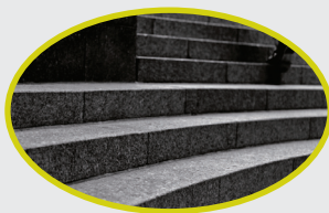
Business & Management