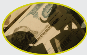
Economics & Finance